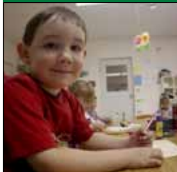
The first three years of a child's life are an amazing time of development and growth. For children with developmental delays, this time is especially important.

The Staten Island Early Learning Center offers cost-free, comprehensive educational experiences for children with cognitive or language impairments, social and emotional difficulties, or sensory and motor problems. Come experience this inspiring program that promotes growth and development and encourages all students to discover and explore!