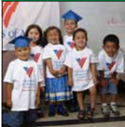
Classes for children with developmental delays meet a critical need in low-income neighborhoods where these issues might otherwise go untreated.

Visit the Bronx Early Learning Center, our no-cost pre-kindergarten program that serves 260 children each year, two-thirds of whom have significant developmental delays such as autism, Down syndrome, and neurological and emotional problems. Take a tour during Operation Backpack when each student gets to choose his or her own backpack for the start of a new school year!