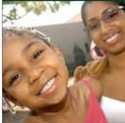
Homelessness can strike anyone, even entire families.

Learn more about how homelessness affects families in New York City. Visit the Regent Family Residence during Operation Backpack 2010 and witness the joy as children get to choose their own backpack filled with supplies for the upcoming school year.